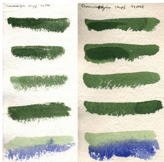
Chinese Rice Paper